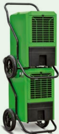
REMKO dehumidifiers are stackable