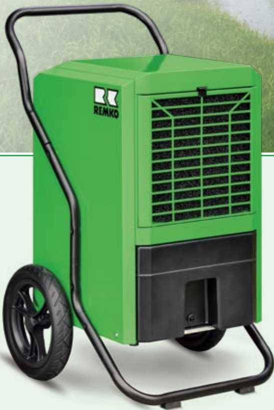
Professional Dehumidifier with electronic control