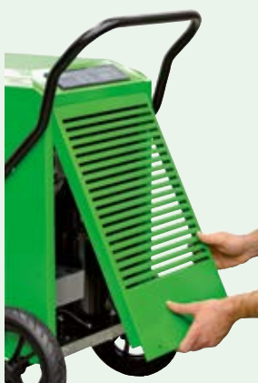
Easy service due to device structure