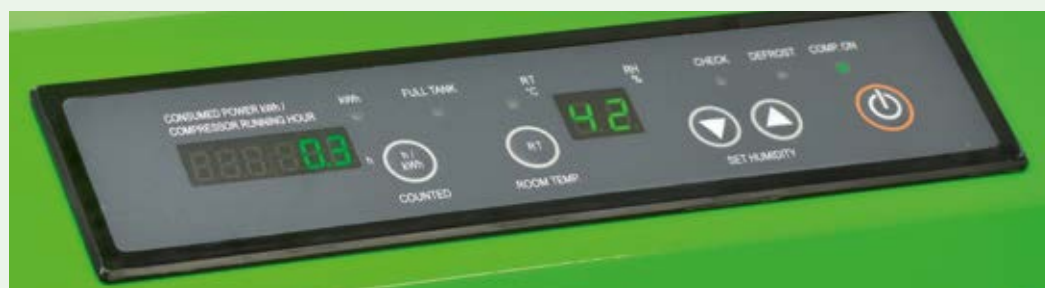
Clearly arranged control panel