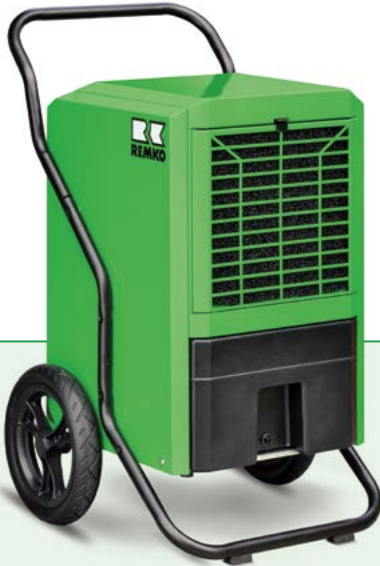
REMKO LTE 60

Drying and dehumidifying more reliable than sun and wind